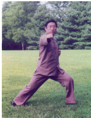
Grandmaster Chen Xiao Wang