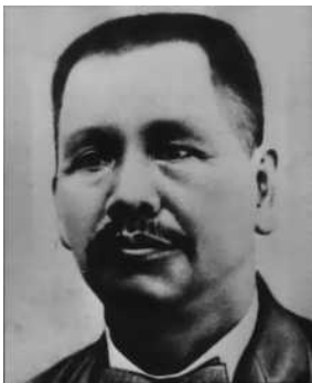
Grandmaster Gan De-Yuan