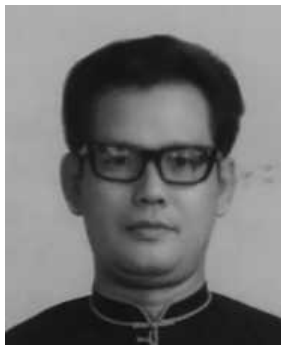
Grandmaster Gan Hu-Chang