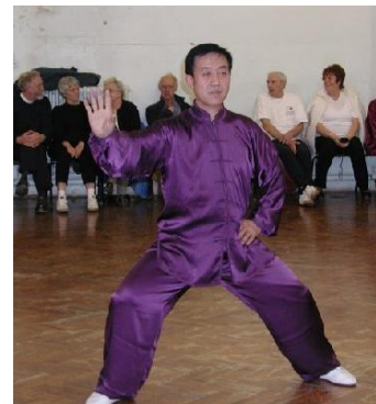
Grandmaster Chen Zheng Lei